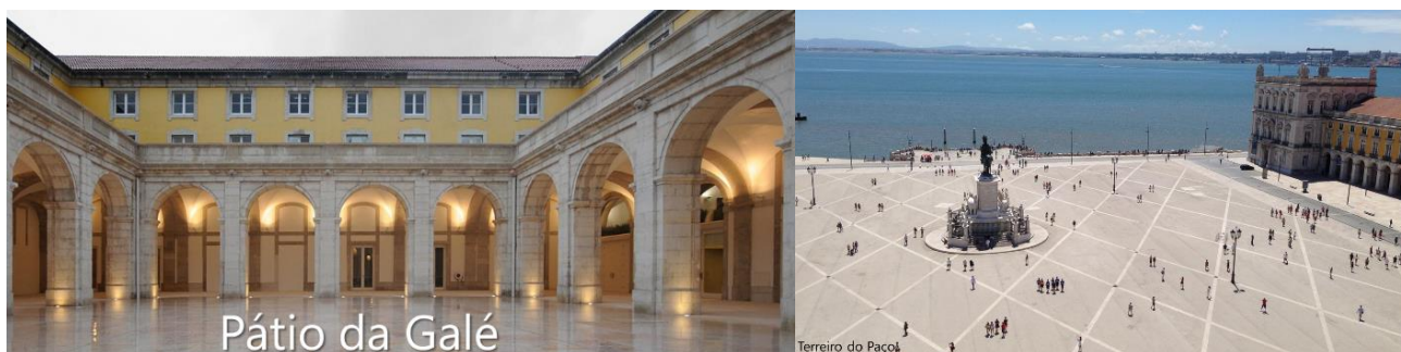
Pátio da Galé