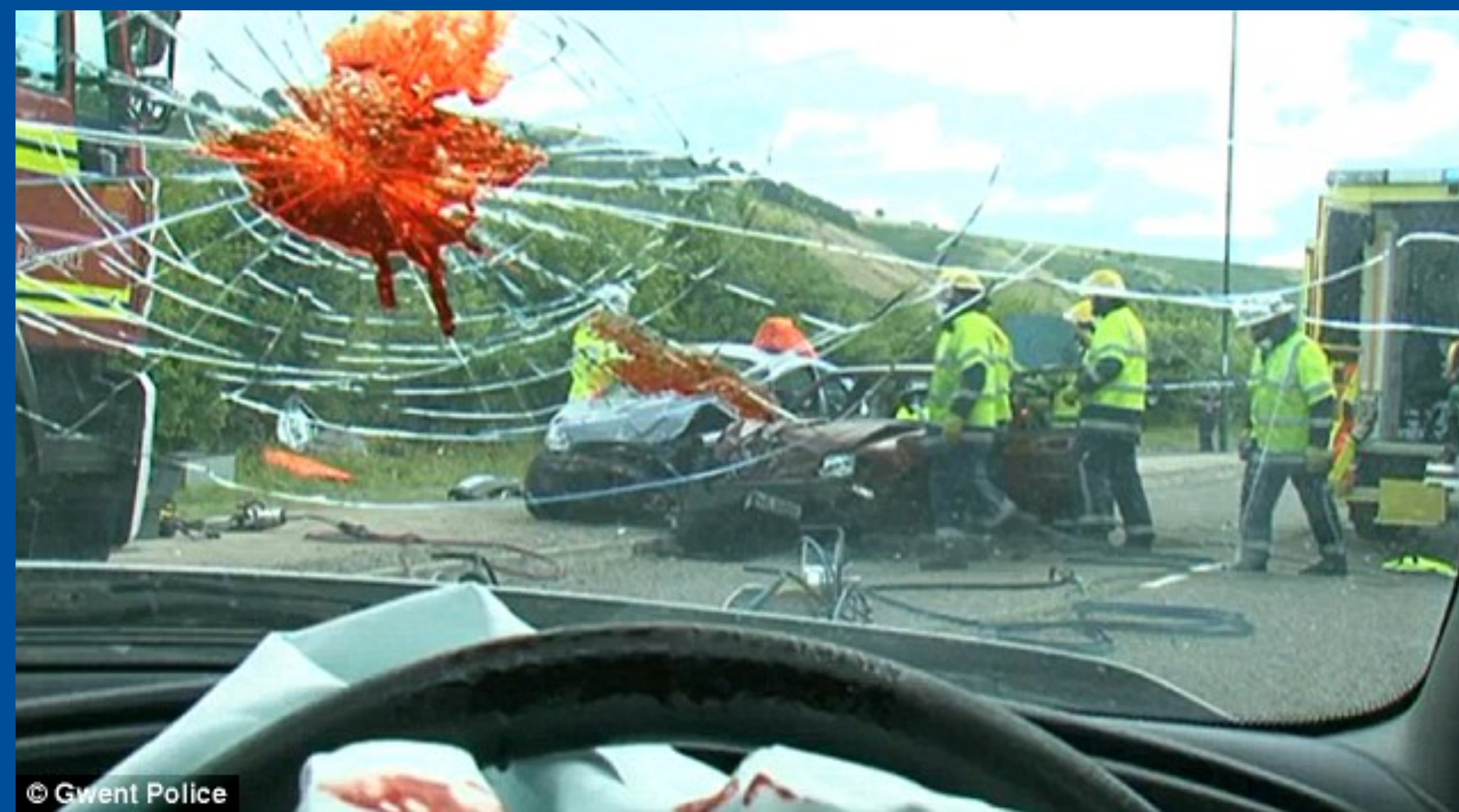
Figure 1: A still from the traumatic film (click image to play full film)