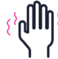
Tintelingen in handen en voeten