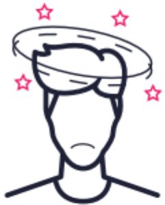
Duizelig en verward voelen