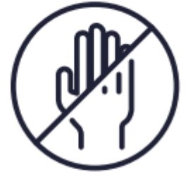
Geen gevoel in handen en voeten