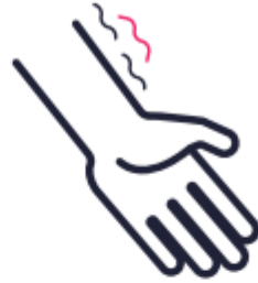
Slap gevoel in armen en benen